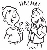
1 telling jokes